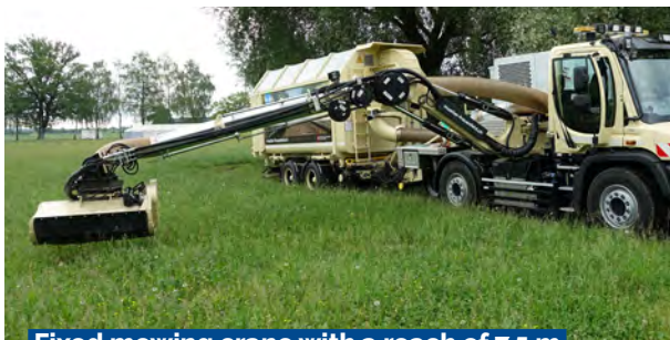
Fixed mowing crane with a reach of 7.5 m