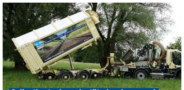
Collection tank can be tilted and removed, with a capacity of 28 m 3