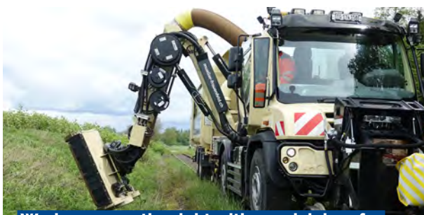
Workspace on the right with special door for optimal view